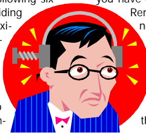
There are worse things than moving house!

ing flexible with employees than moving house. Step 5, Try to stop worrying, as worrying makes you feel more anxious, diminishes concentration and contributes to poor sleeping patterns. If you have planned your move and made a list of "things to do" you have done all you can. Remember you cannot control all aspects of the process, it is impossible, Do what you can and then relax. Step 6, Picture the whole move in your head and imagine a smooth move. Don't anticipate disaster or your stress levels will go through the roof. According to Kasia Szymanska, "Buying a new property is a lengthy and complex process and is considered to be a key lifestyle change. The symptoms outlined in this survey are very common and can make you more stressed at work. In particular feeling tired and nervous, increased anxiety and feeling more irritable than usual. Use the steps outlined to avoid these pitfalls, relax and enjoy your move. Step 1, "Get practical" make a list of things that you need to do, and remember to tick things off as you go down the list. Step 2, "Don't stew!" Procrastination only makes you worry about things you could be taking action on! Don't put off doing things that need to be done now, inevitably you will feel more stressed in the long run. Step 3, Always take regular breaks and eat healthy meals. Even such small actions go towards preventing the build up of stress. Step 4, Put the move into perspective, There are much worse processes to go through