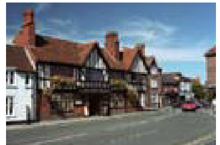
Prospects looking good for employment in Thame

Prospects for the year ahead appear good although uncertainties about the national and international outlook make forecasting more difficult than usual.